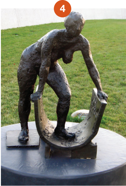
Anthony Caro (British, born 1924)

Air gets into everything even nothing further investigates Ugo Rondinone's interest in time, displacement, and the relationship between natural and artificial environments. While this sculpture is at once realistic — it's an exact replica of a still living 2,000-year-old olive tree — it is also a man-made construction fabricated from aluminum and covered with white enamel. Rondinone plays with the idea that the original tree is a living entity with deep, history-rich roots, while this ghostly image has nothing beneath its surface to affix it to a permanent location.