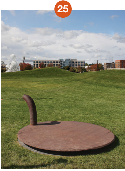
Martin Puryear (American, born 1941)

Five Plate Pentagon is a sculpture comprised of five unpainted steel plates, assembled together in a manner resembling playing cards delicately balanced against one another. While it can be tempting to look for a narrative inroad into the piece, the artist is not concerned with conveying any specific story or emotion. Instead, the work is about the formal properties of the unadorned steel, the lines in space that are carved out by the plates, and the viewer's interaction with the sculpture in a given moment.