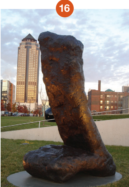
William Tucker (British, born Egypt, 1935)

Like many artists of the 1960s, Scott Burton was interested in blurring the line between art and everyday life. His approach to achieving this was to make sculptures that function as furniture and place these pieces in public spaces where people would be invited to use them. His artwork begins with refined, immaculately constructed furniture like this table and chairs, but only becomes complete when visitors actually use the pieces. Thus, Seating for Eight and Café Table I are the only sculptures in the park that visitors are allowed to touch. Two distinct artworks that have been combined together, here they function as a central resting place in the park. The cool, smooth, granite seats form a democratic circle as opposed to a hierarchical "head of the table" arrangement. The sleek lines and balanced curves of the work reveal Burton's elegant sense of design, as well as the influence of the Minimalist art movement of the 1960s and 70s. Burton was also conscious of the inherent beauty of the marble he chose as his medium, polishing it to a high sheen that highlights the grain and color of the stone.