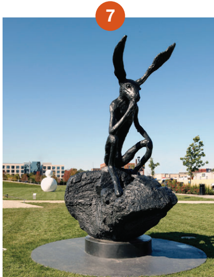
Barry Flanagan (British, 1941–2009)

With Spider , viewers are confronted by an oversize version of a creature most would view with terror at its normal, tiny size. The knobby joints of the spindly legs are arranged at various heights and imply movement, but the delicate egg sac hanging from this creature should be seen as more than the stuff of nightmares. The artist, Louise Bourgeois, has been using spiders in her work since the 1940s, and in the 1990s began sculpting them into colossal forms like this. Surprisingly, she sees them not as ominous predators, but as a symbol for her much beloved mother. The artist's own words explain her intentions best, "My mother, who like a spider, was a weaver. My mother was my best friend. She protected me and was clever. I want them [the spiders] to envelop me and protect me. I want them to be strong and monumental like my mother. But my mother was also ill. They reflect her strength as well as her fragility, since they balance on tiny points." As evinced by this quote, Bourgeois mines her personal biography, particularly her childhood memories, as the basis for her artwork. The allusion to her mother as a weaver refers to the Bourgeois family's tapestry restoration business, in which her mother was the chief seamstress. The statement also reflects the untimely death of Bourgeois' mother who passed away when the artist was just 20 years old.