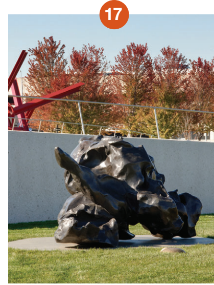
Willem de Kooning (American, born Netherlands, 1904–1997)