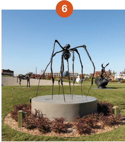
Louise Bourgeois (American, born France 1911)