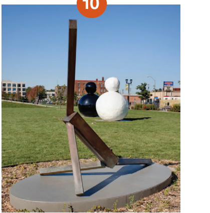
Joel Shapiro (American, born 1941)