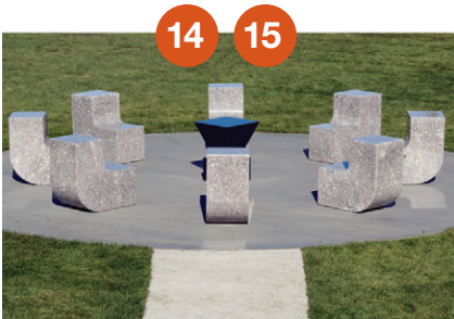
Scott Burton (American, 1939–1989)

Gary Hume's art is distinguished by bright, expressive colors, luscious surfaces, and simplified forms. While the human figure and face have often been the subject of his work, imagery from childhood such as bears, rabbits, and the snowman that make up these two works are also common themes. Hume is a painter as well as a sculptor, a fact suggested by the glossy, smooth surface of these sculptures that is unlike any other work in the park. The title Back of a Snowman plays a clever joke on the viewer, in which no amount of circling will reveal the snowman's front.