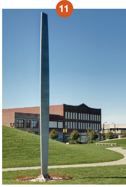
Ellsworth Kelly (American, born 1923)

Joel Shapiro adapted the rigid, geometric shapes of the Minimalism movement of the 1970s to create his particular interpretation of the human figure. Hard-edged rectangles rather than soft organic masses come together to create a recognizable human form, despite the lack of naturalistic detail. In Untitled , the figure leans back on one arm, with its legs splayed widely across the platform. The fourth appendage can be read as either a downturned head or the second arm reaching upward. Shapiro's figures are often posed awkwardly, seeming off balance or in the midst of an ungraceful motion, and this ungainliness lends the work personality and a warm, human vulnerability. Shapiro himself says the sculpture is "definitely about stretch and compression; about reach and contraction."