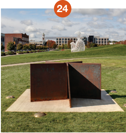
Richard Serra (American, born 1939)

Jaume Plensa uses letters as the basic components of much of his art, which explores communication issues whether between individuals or cultures. This work depicts a crouching, anonymous figure, with a "skin" composed of letters from the Latin alphabet. The sculpture exemplifies Plensa's ongoing interest in ideas presented in written text, as well as the human body and how it perceives the world around it. He has described individual letters or symbols as components that have little or no meaning on their own, but blossom into words, thoughts, and language when combined with others. Plensa's screens of letters offer a metaphor for human culture, in which a person alone has limited potential, but when formed into groups or societies, becomes stronger. Nomade engages the viewer on many levels, from our recognition of the letters that form the shape, to our own physical interaction with the work as we view it from afar or from inside the work's interior space.