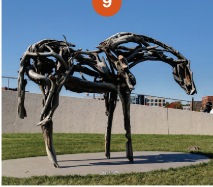
Debora Butterfield (American, born 1949)

Juno , 1989 Cast bronze 76 x 68 x 88 inches