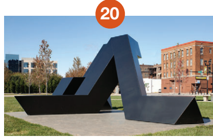
Tony Smith (American, 1912–1980)

Marriage , 1961 Painted steel 120 x 144 x 120 inches