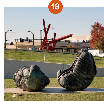
Tony Cragg (British, born 1949)

Along with Jackson Pollock and Mark Rothko, Willem de Kooning was a central figure in the American art movement Abstract Expressionism. He is best known for his abstract figure paintings on the theme of "woman" created in the 1950s and 60s. On a trip to Rome in 1969, when de Kooning was 65 years old, he modeled his first sculptures and over the next five years made about 25 bronze figures using the same gestural techniques and expressionist style of his earlier paintings. Reclining Figure captures the immediacy of the artist's hands pushing the clay around, implying action, emotional energy, and the gestures of the human body. While highly abstract, the woman's figure can be seen in the suggestion of an arm propping up a body and a leg kicking in the air.