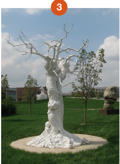
Ugo Rondinone (Swiss, born 1963)

These childlike and somewhat awkward faces are two from a series of twelve sculptures titled MOONRISE . Each sculpture depicts an exaggerated expression and is named after a month of the year. East, January has a mischievous appearance with its toothy grin, squinty eyes, and pointy nose; east, august has a sympathetic look conveyed through the head's tilt, hum-drum mouth, wide-open eyes, and button nose. A texture resembling finger marks in clay covers each, adding to their youthful charm. Ugo Rondinone created this series in homage to the moon in a time when our day-to-day reliance upon it has waned and its mythic significance has faded. Yet despite modern man's changed relationship with the moon, Rondinone is drawn to it for its universal accessibility and its significance as a marker of the passage of time.