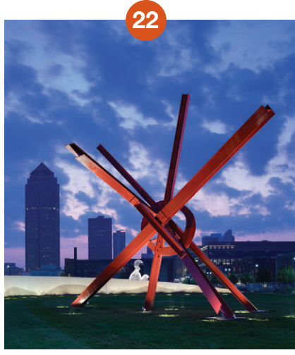
Mark di Suvero (American, born China, 1933)

Sol LeWitt cemented his reputation as one of the most critical figures of 20th-century American art by helping found the movements Minimalism and Conceptualism. His art, comprised of the most basic shapes and blocks of vibrant color, was often organized by logic and geometry but still maintained a sense of playfulness and freedom. LeWitt's sculptures, which he preferred to be called "structures," use repeated shapes to build architecture-like forms. In this work, perfect white cubes are arranged in a deceptively simple composition. While the sculpture has the finished dimensions of 109 x 55 1/2 x 55 1/2 inches, it could in theory, extend in any direction in infinity using exactly the same formal units — the word "modular" in the title reinforces the idea of endless identical attachments. In the urban setting of the sculpture park, the work also calls to mind office buildings or condos with their endless stacks of similar units. While LeWitt was not interested in emotional content within his work, he still acknowledged the visual dynamism of the negative spaces and sharp lines created by cubes silhouetted against space. These subtle shifts in the viewer's perception and perspective were crucial factors in his work.