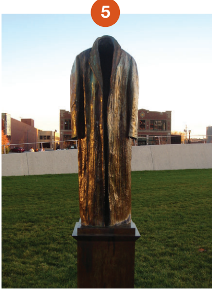
Judith Shea (American, born 1948)

Anthony Caro is best known for abstract metal sculptures, painted in lively colors and removed from any tie to a pedestal-stature relationship. Having achieved a good deal of success with that work, Caro founded the Triangle Workshop in 1982 in New York and invited 30 artists from the U.S., Canada, and Britain to join him in the summer months to experiment with ideas and techniques outside of their everyday practice. For Caro, this took him back to a process he had not employed since his student days at the Royal Academy—drawing and modeling from the nude model. In the Morning is the result of the early years of the workshop and depicts a woman stepping into a bath. Facial features are only subtly suggested in favor of emphasizing the posture, movement, and weight of the body. In titling the sculpture In the Morning , Caro not only evokes the regular ritual of bathing but the intimate, everyday nature of its subject.