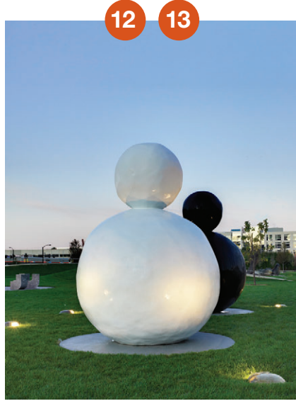
Gary Hume (British, born 1962)

Untitled is an elegant obelisk that is surprising to walk around and view its relationship to the park. When viewed straight on, the form is sturdy and full, with an assertive shape. Moving around the sculpture, it takes on a more fragile appearance, almost completely disappearing into itself. The situation of this piece in the center of the park is well considered, encouraging viewers to actively notice the environment of the park and its urban context.