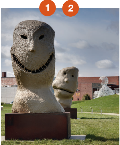
Ugo Rondinone (Swiss, born 1963)

MOONRISE, east, august , 2005 Painted cast aluminum on steel plinth 94 3/4 x 47 1/2 x 48 1/4 inches