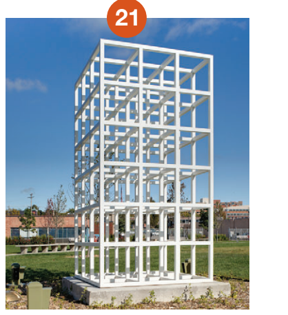
Sol LeWitt (American, 1928–2007)

Tony Smith's earliest sculptures date to his days spent quarantined from his family while he recovered from tuberculosis. The ample supply of medicine boxes used to treat his illness provided the medium for his small scale models and his imagination. Smith's long career in architecture was also highly influential on his output as a sculptor, evidenced most directly in the large scale of his work and the building-like manner in which his shapes interact with their surrounding space. Marriage and Willy are among Smith's important early large-scale works. In both sculptures, Smith masterfully combines abstract geometric forms with human characteristics. The works' titles, a person's name and a dominant cultural institution, imply specific interpretations for each of the sculptures. Formally, Marriage offers an arch for the viewer to pass through, and presents a sort of dialogue between the various connecting rectangular blocks. Willy involves more complex polyhedral shapes. Here, the flat black planes of steel twist into each other with less geometrical order, suggesting an anthropomorphic (or human) form. The title comes from a Samuel Beckett play Happy Days (1961), in which the character "W Willie" crawls submissively around his wife, who is buried waist deep in mud.